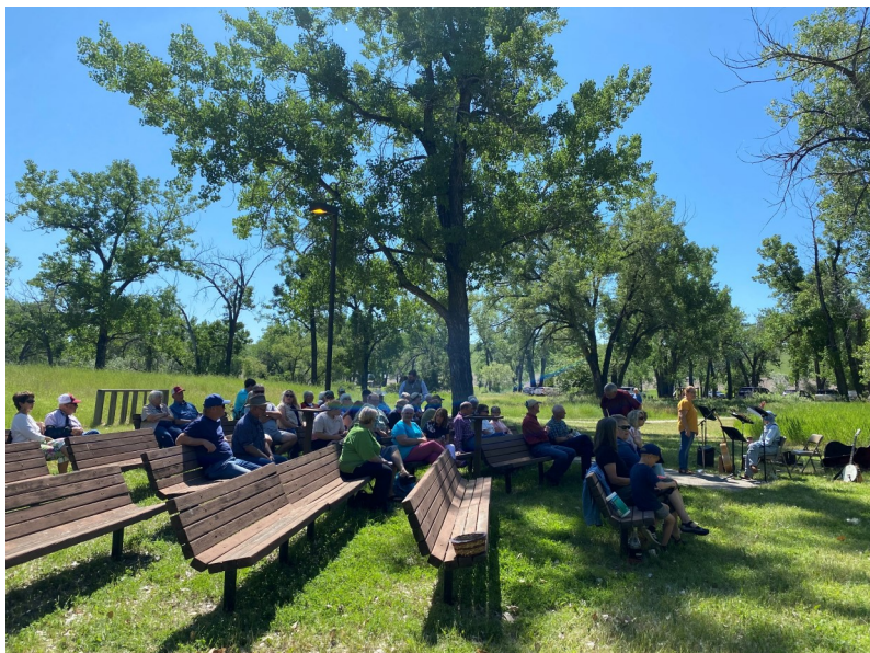
Waiting for outdoor church to start. Beautiful Day. Wonderful event!

Church Office Summer Hours: Tuesday & Wednesday 9-3:30 Thursday 9-Noon