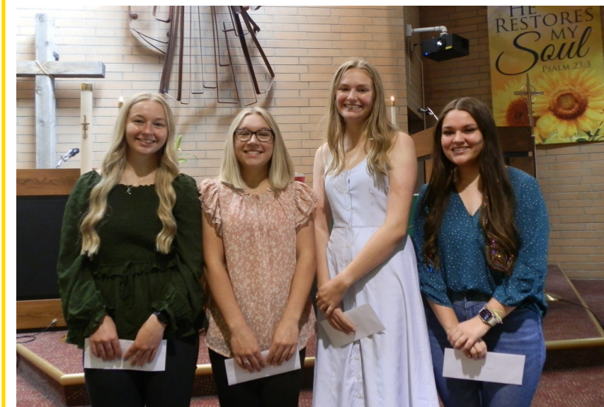
2023 FLC Foundation Scholarship awardees on Scholarship Sunday.

The First Lutheran Church Foundation is perpetual fund that was established in 1979. Only the interest earned on the fund is expended. The earnings from the Foundation are intended for special needs and programs, not the ordinary administration and maintenance of the church. The interest may be used scholarships, special donations, and capital improvement projects. In 2023, the First Lutheran Church Foundation awarded 6 scholarships. The scholarships can be awarded to college students who are entering their second, third, or fourth year of an undergraduate or technical school program. FLC Foundation donations for 2023 include, the FLC Lift Project, Troop 861 Boy Scouts, Flathead Lutheran Bible Camp, Lutheran Disaster Response, Operation Bootstrap Africa, and ELCA Ministries.